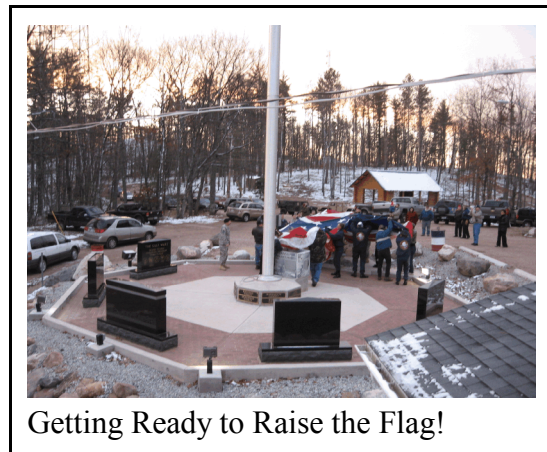
Getting Ready to Raise the Flag!

As I go through the many QSL and certificate requests, I see many comments from veterans thanking us for the event.